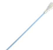
MAP600 Plastic Insertion Tool