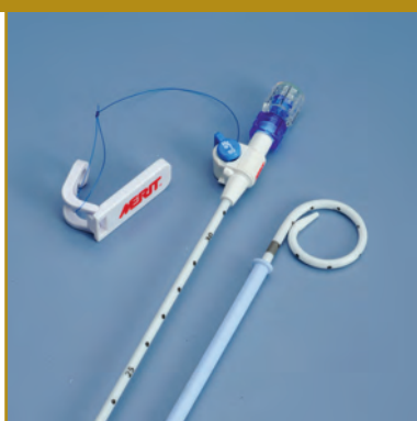
ReSolve® Drainage Catheters