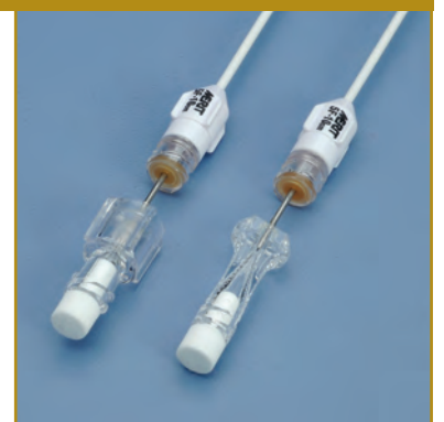
One-Step™ Centesis Catheters