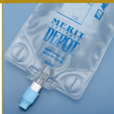
MDD600 Drainage Bag