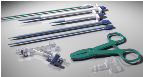
Accessory Component Kit