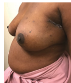
Figure 4: 2 weeks post-op

The utilization of SCOUT® allows the surgeon to choose the ideal incision location. In this case, a single axillary incision was utilized for both the lymph node and breast cancer for a beautiful aesthetic outcome.